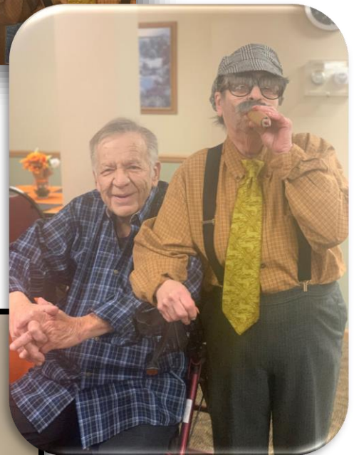
Great times with neighbors!