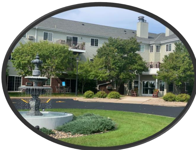
In September our parking lot got seal coated and it looks amazing!