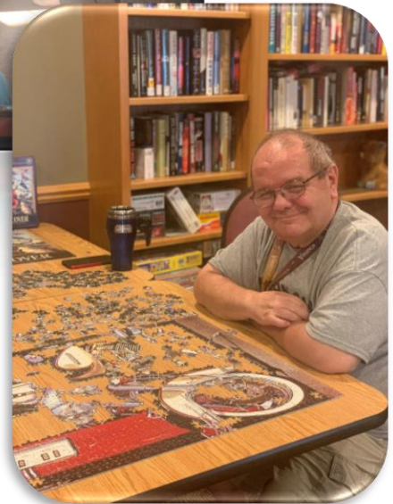
There is always great company and good times at the puzzle table.